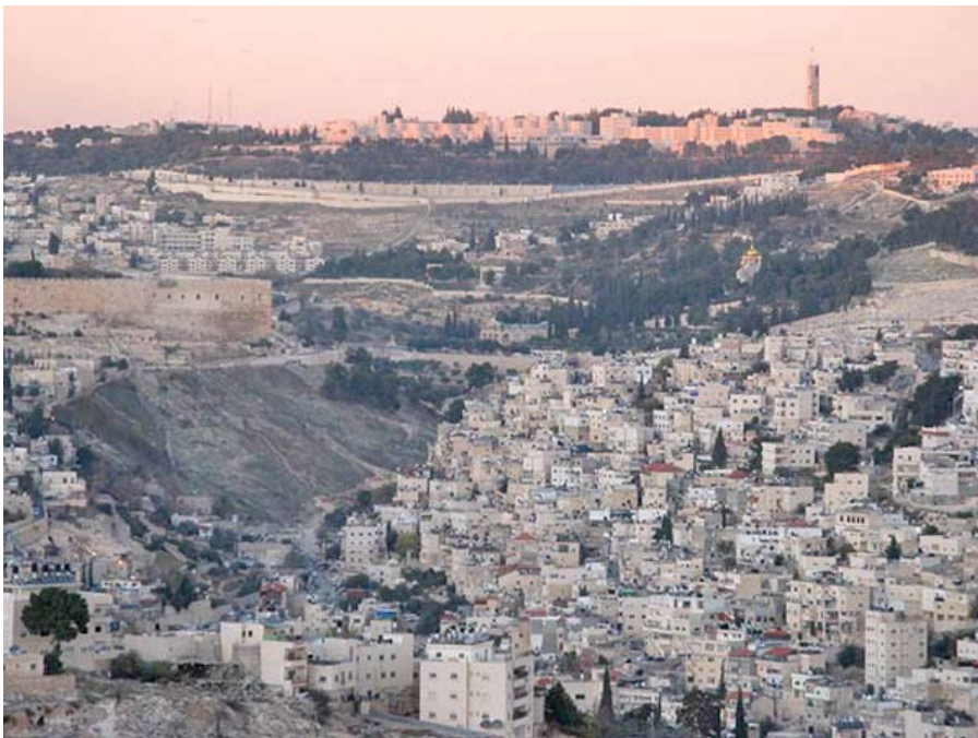
Hebrew University as seen from the East Jerusalem village of Silwan

All Israel's universities veil the state's ongoing displacement of Palestinians by signifying scholarship and 'civilization', but the Hebrew University enjoys a special position within this pantheon. Its conception goes back to 1882; its foundation stone was laid as early as 1918 by Chaim Weizman and General Allenby; Lord Balfour opened it officially in 1925. Albert Einstein was invited to deliver the first public lecture at the Hebrew University though he “ opposed the idea of a Jewish state , with borders, an army, and a measure of temporal power”. The University's primacy is strikingly visible in its extension across Mount Scopus, Jerusalem's highest point.