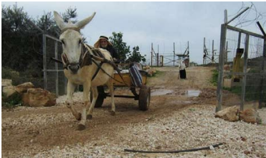
Jayyous Village