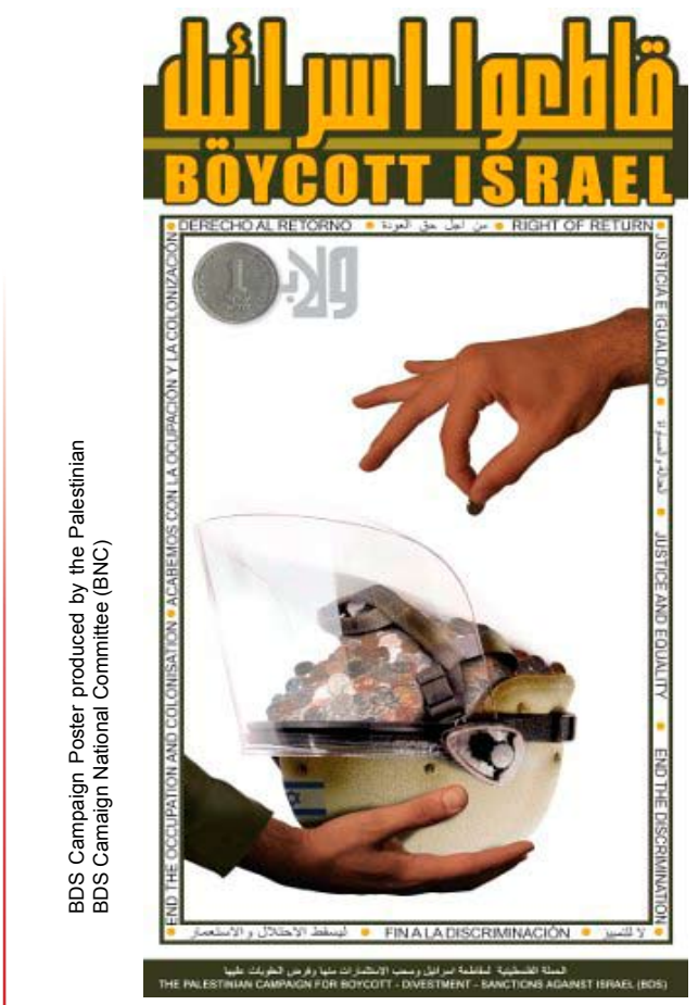
BDS Campaign Poster produced by the Palestinian BDS Campaign National Committee (BNC)

Eight years since the 2005 BDS Call, the principal question for the movement is if the tactic is being incorporated into a common Palestinian vision and political commitment? It is important to cultivate a culture of ‘internal’ resistance (within the homeland) that feeds into actions on ‘external’ levels (internationally). Several factors contribute to the current condition of political inaction among the Palestinian populace: pending reform of the Palestine Liberation Organization, fractured Palestinian political factions, the reign of the Palestinian Authority and logic of Oslo, the widespread disappointment with the Palestinian leadership’s performance and the growth of an ‘NGO culture’ oriented towards donors’ agendas rather than collective concerns. As a result, Palestinian national values of struggle for liberation have receded.