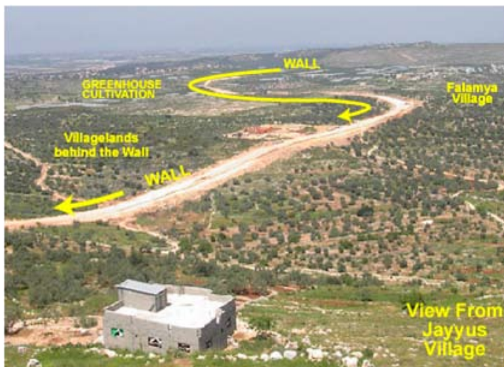
Jayyous Village.