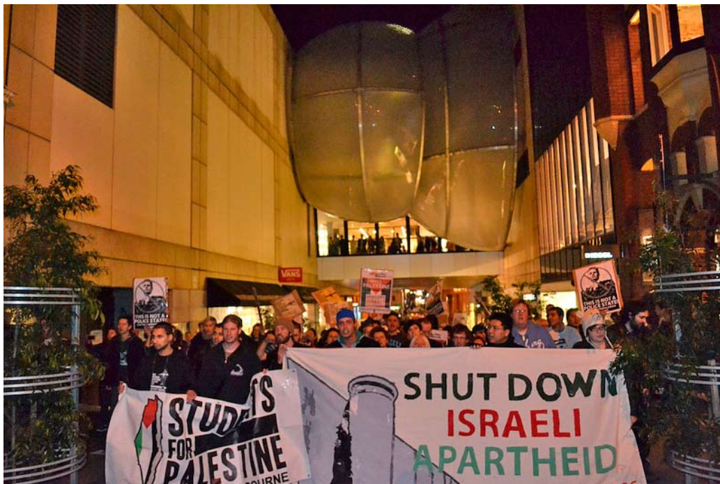
BDS Max Bremer July 29 2011. This was the first BDS protest in Melbourne after the July 1 demo that was attacked by police and led to mass arrests. So protesters were defending the right to demonstrate, as well as opposing Apartheid Israel.

The growing boycott, divestment and sanctions (BDS) movement is a refreshing development for those outraged by the injustices committed in Palestine and the policies of decision-makers who stand silent in the face of these injustices. It allows people from all over the world to participate in confronting these injustices by channeling the energy and political activism to certain targets. Yet, the movement needs to beware not to fall into the three traps of dogmatism, legalism, and rhetorical excess.