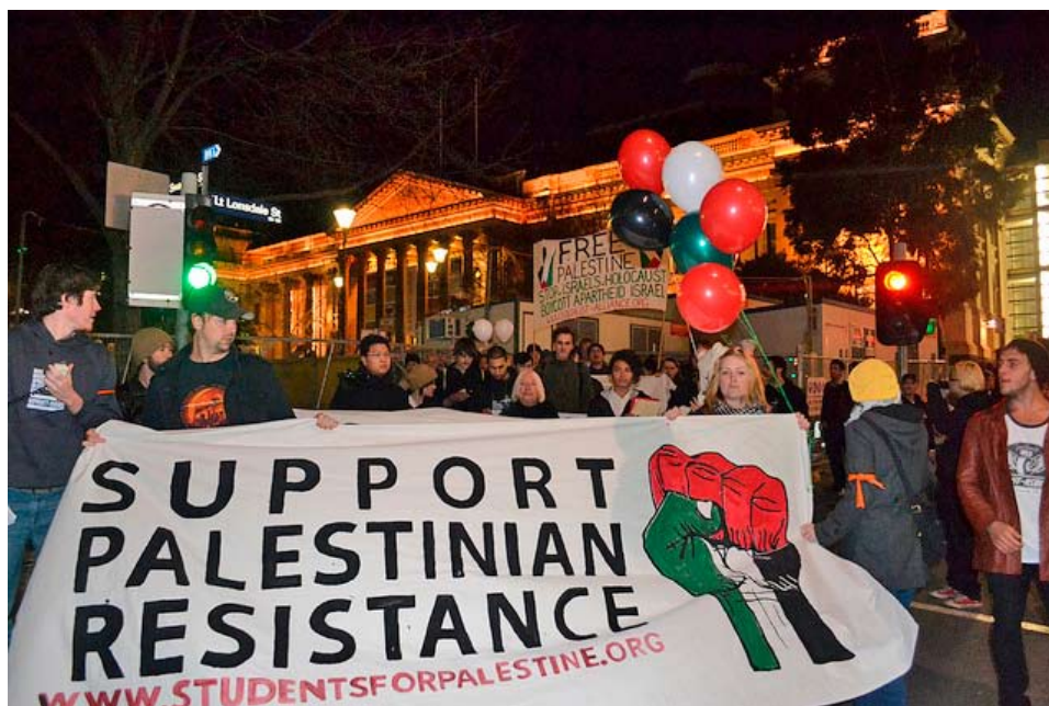
BDS Max Brenner July 29 2011, This was the first BDS protest in Melbourne after the July 1 demo that was attacked by police and led to mass arrests. So protesters were defending the right to demonstrate, as well as opposing Apartheid Israel.

T he European Union (EU) evolved to become an important player in the Middle East's power configurations and political dynamics. In the case of the Israeli-Palestinian conflict, EU policy has been inconsistent and incoherent.