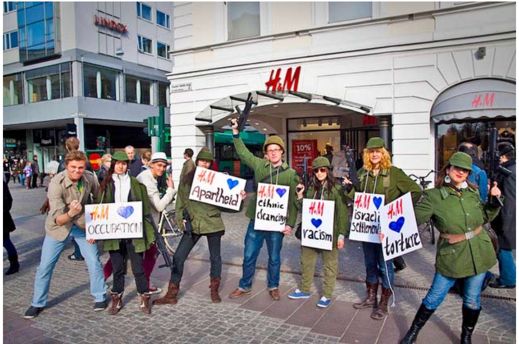
H&M demonstration, Malm

This 54th issue is the third al-Majdal to feature BDS as a theme. The first was issue no. 26 ( Spring 2005 ) simultaneous with the launch of the BDS Call. On the third anniversary of the BDS Call, in Summer 2008 ( issue no. 38 ), BADIL published a special extended issue featuring BDS. Within only three years from the launch of the BDS Call, al-Majdal 38 carried contributions from BDS activists based in Australia, the Basque country, Belgium, Brazil, Canada, Catalonia, England and Wales, Ireland, Israel/Palestine, Italy, Norway, Scotland, Spain, South Africa, Sweden, Switzerland and the USA. The growth of the BDS movement within the first three years was no less than astounding. As a way to track these developments BADIL dedicated a section of al-Majdal for “BDS Updates” beginning in 2005. However, due to the proliferation of BDS activities and those who specialize in documenting them, the editors of al-Majdal decided to discontinue the “BDS Updates” section as of issue no. 52 ( Spring 2013 ):