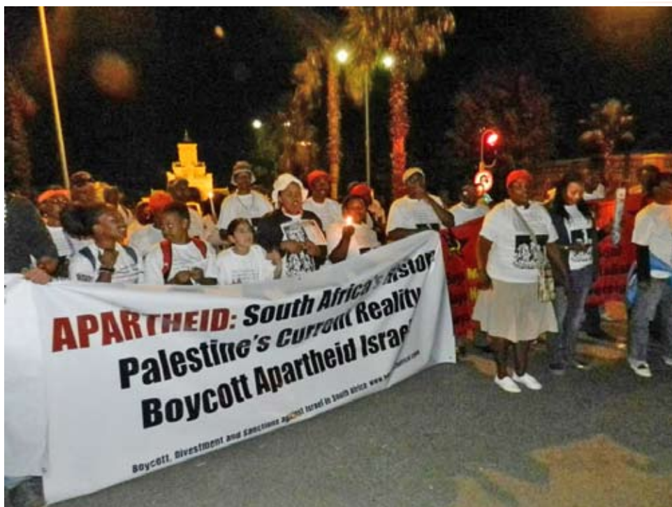
Palestine solidarity demonstration in South Africa.

The BDS campaign has come a long way in the past eight years. In addition to a myriad of campaign achievements worldwide, BDS has also contributed to shifting the discourse away from “two ethnic groups squabbling over land” to one in which “one group dominates another and deprives it of basic rights – a clear moral issue,” (see Lessons from the Campaign for Sanctions on Apartheid South Africa page 10). If, in summer 2008, articles about BDS needed to elaborate on the term ‘apartheid’ (see Applicability of the Crime of Apartheid to Israel in al-Majdal 38), it is possible to say that in 2013 this is no longer necessary. In a few years, “[...] the analysis of Israel as an apartheid regime [...] has become widespread in the BDS movement,” ( Editorial , al-Majdal 38). However, in addition to well-deserved congratulations, much work remains on outstanding issues that the movement needs to address.