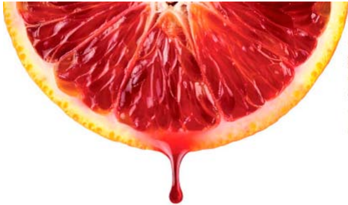
Poster used in a Belgian boycott campaign, 2003: "Israeli fruit tastes bitter. Say no to the occupation of Palestine. Don't buy fruit and vegetables from Israel."

Belgium is slightly exceptional since we initiated a campaign calling for the boycott of Israel in 2003, preceding the united call of the Palestinian grassroots organizations in 2005. Our BDS campaign received confirmations from all major Flemish Non-governmental organizations, we used poster advertisements calling for a social justice-based boycott and published the campaign in media outlets.