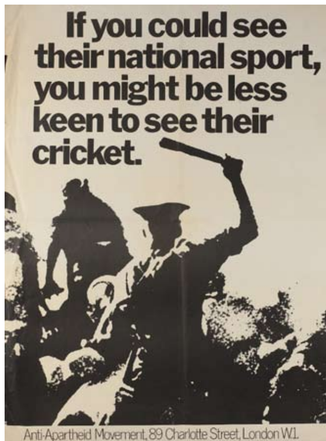
Poster protesting against the planned 1970 Springboks cricket tour of England and Wales. The tour was called off after widespread protests.

The second issue raised by the South African experience is, of course, organization. BDS at present is a campaign, not an organization. That is a strength if it makes room for the energies of many more people. But it is a weakness if there is no organization which acts as a focal point for campaigners. The campaign will not liberate Palestinians on its own: its role is to force the Israeli state to a balanced negotiation table.