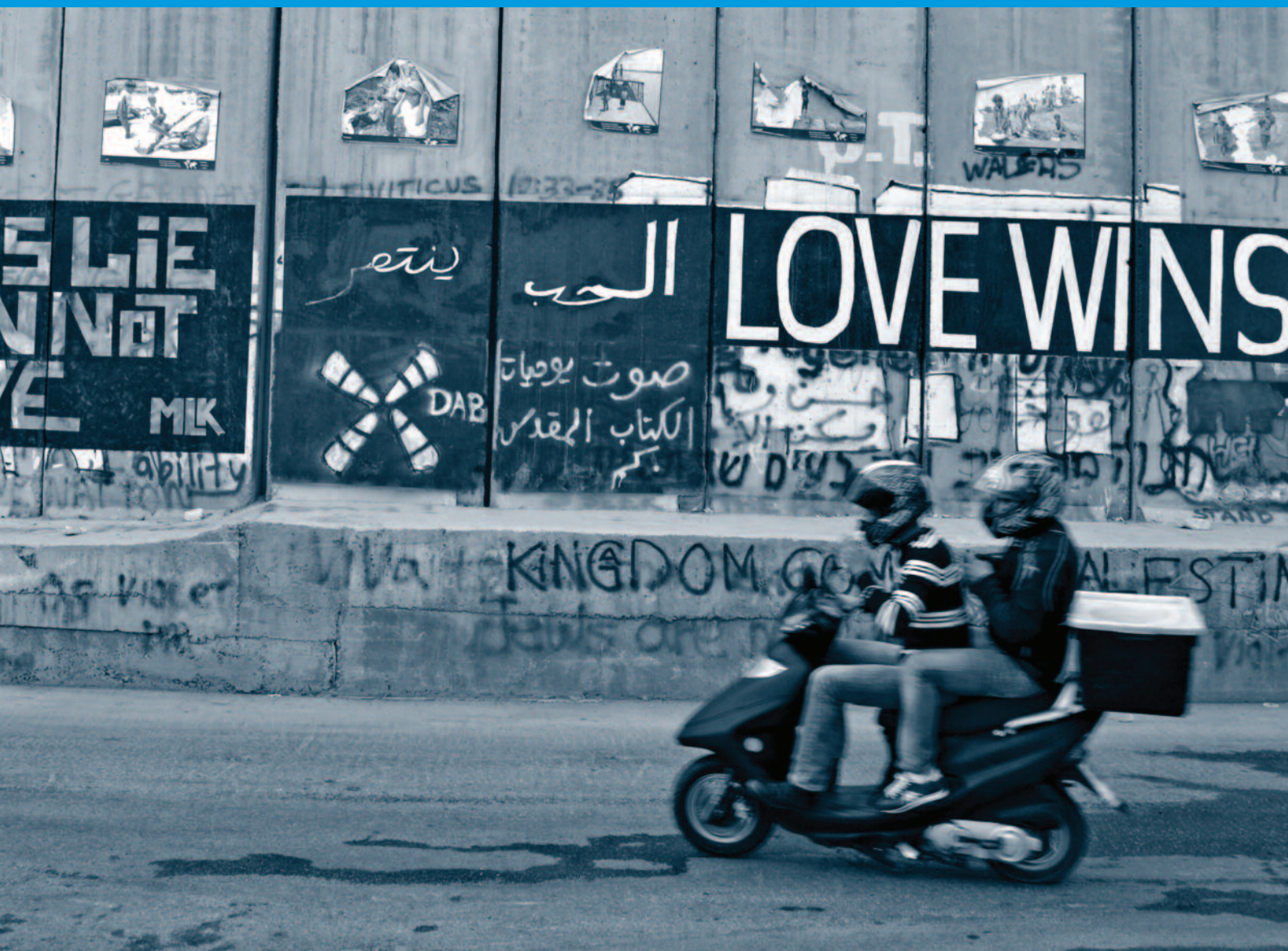
The separation wall in Bethlehem