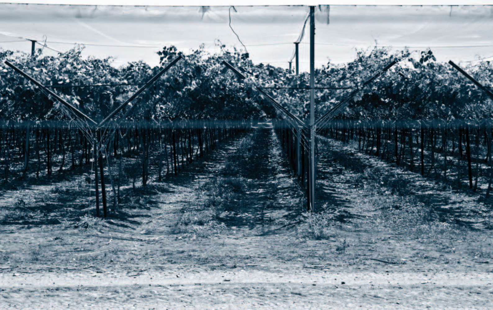
A settlement farm in the Jordan valley growing grapes