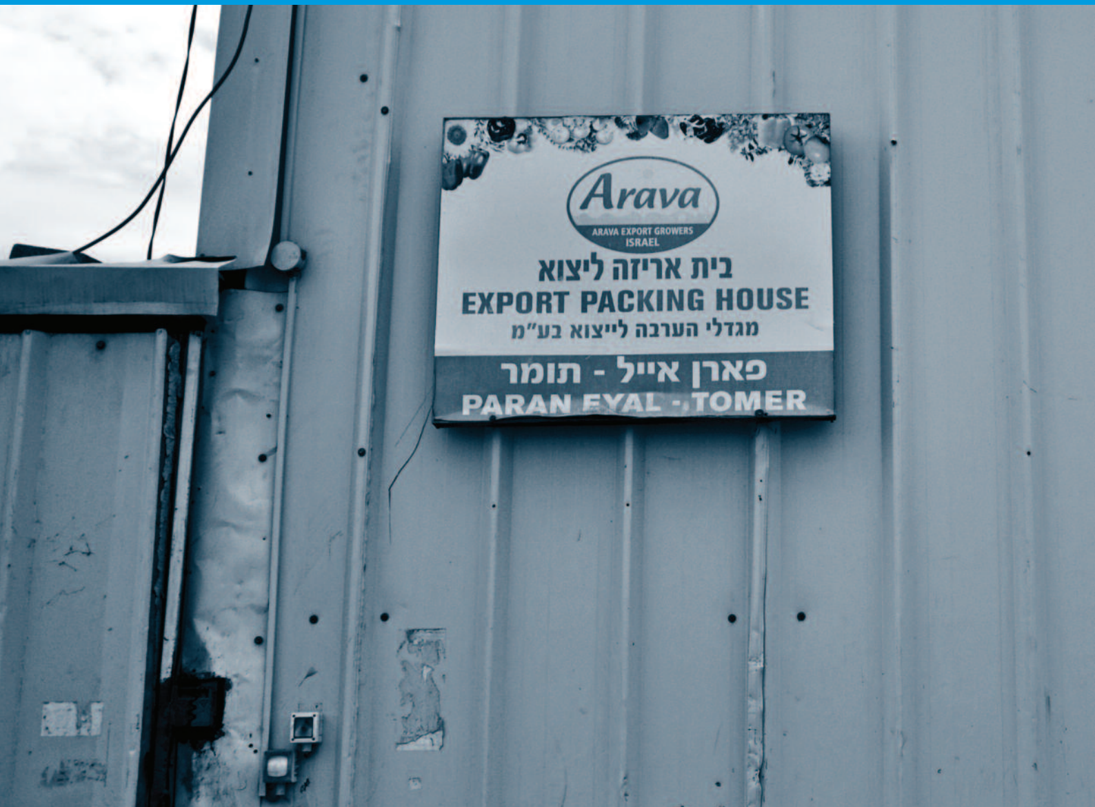
Arava export packing house, in the Jordan Valley