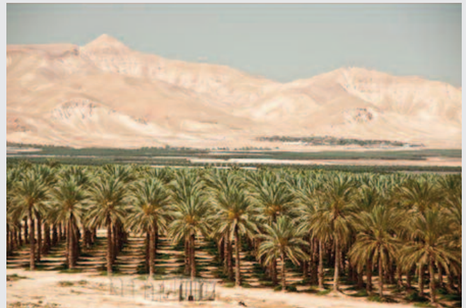
Date tree plantations in the Jordan Valley, in the settlement of Masu'a

Such actions from retailers can show that if traceability mechanisms are put in place, and pressure placed on suppliers further down the supply chain, retailers can ensure goods are not sourced from the settlements.